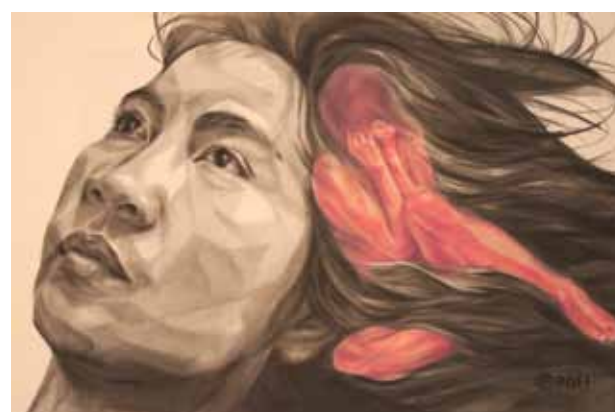
Rofizano Zaino 'MEND ME', Mixed media on paper, 600 x 900 mm, 2013