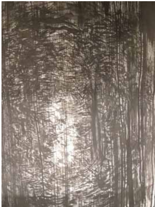
Amanda Soon 'ABYSS', Chinese ink on Indian cotton rag paper, 590 x 420 mm, 2012